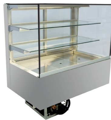
Symbol photo: model pro-squared