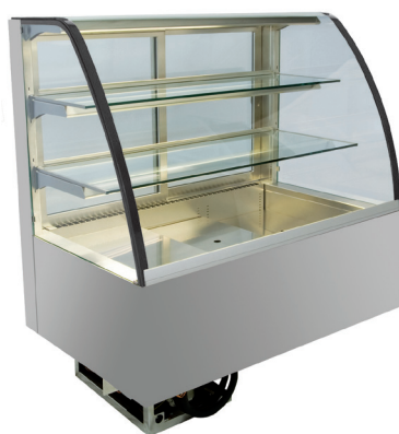
Symbol photo: model pro-curved